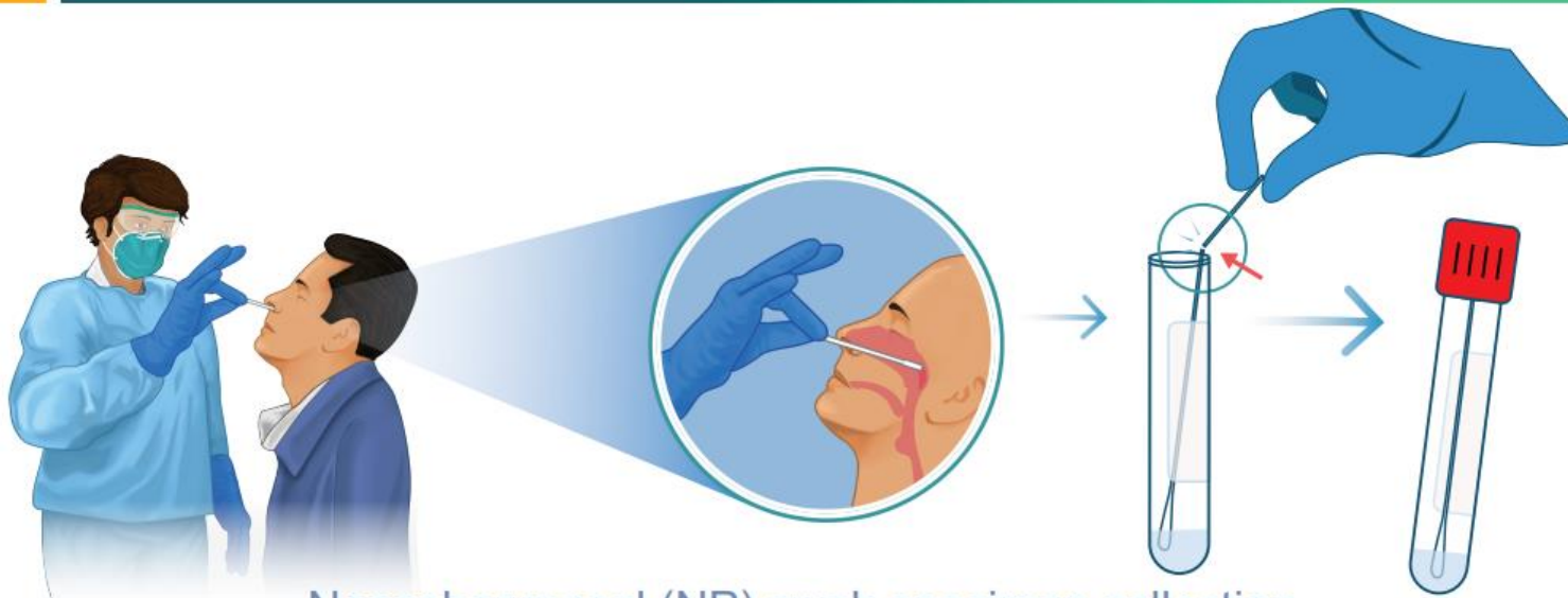
Nasopharyngeal (NP) swab specimen collection